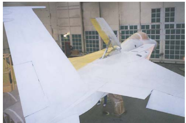
Fig. 4 - JG-PP F-15 test aircraft painted with chrome free primer on half of the aircraft

Most aerospace aluminum structures are protected with chrome in two ways. First the aluminum is treated with a chromate conversion coating. The conversion coating provides some corrosion protection and improves subsequent paint adhesion. The structure is then coated with a chromated primer. The chromated primer provides the majority of the corrosion protection for the aluminum structure. The goal of providing a total non-chrome corrosion protection system for aerospace structures continues to be an elusive objective.