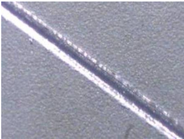
Fig. 5 - Shiny scribe using chromate inhibitors

Although chrome has been used for many years, its mechanism of corrosion protection has only recently been understood. Understanding the mechanism of the chrome free corrosion inhibitors is needed to aid further development efforts. For example, during corrosion testing, scribes through the coating to the base metal appear shiny with chromate corrosion inhibitors (Fig. 5).