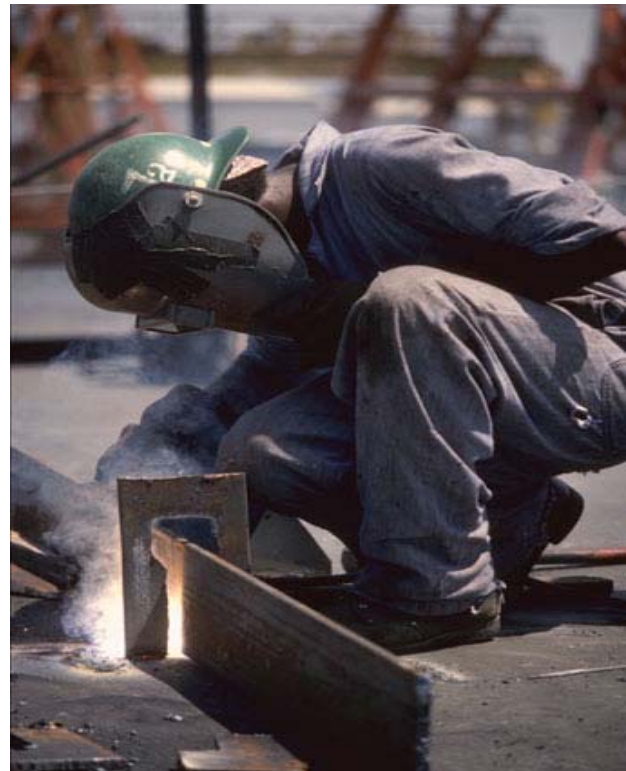
Fig. 2 – Welding – Possible Chrome Fumes