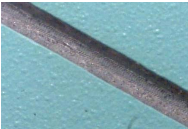
Fig. 6 - Dark scribe using chromate free inhibitors

However, some effective chrome free inhibitors can produce a dark scribe during corrosion testing (Fig. 6). This is an acceptable condition because the dark scribes don't contain corrosion products. Dark scribes just indicate that a different corrosion protection mechanism is occurring with the chrome free corrosion inhibitors.