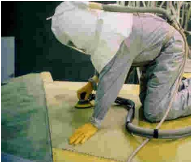
Fig. 3 - Aerospace worker scuff sanding primer containing hexavalent chrome

Eliminating chrome in aircraft paints and coatings would greatly reduce compliance issues associated with the new OSHA rules. However, no one wants to sacrifice corrosion resistance when implementing a non-chrome corrosion protective coating.